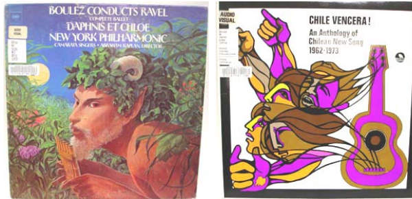
Lps from the MMC collection

Everything from Blues to Broadway can be found in the MMC lp collection.