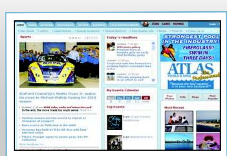
Movable Content Blocks