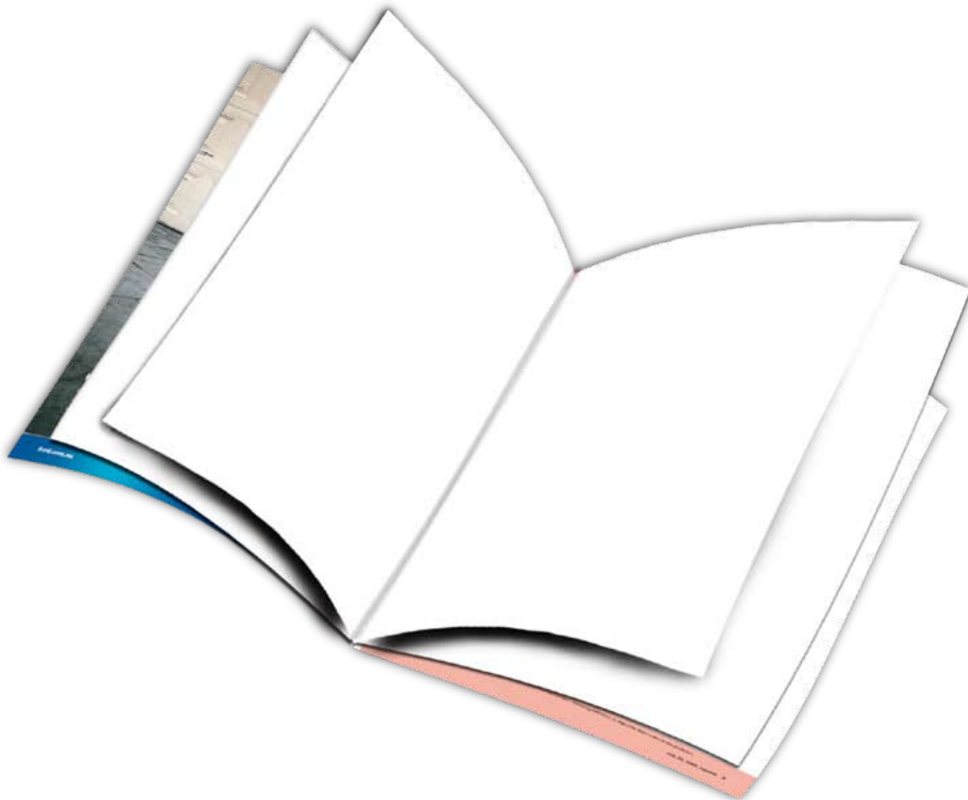
8 PAGE GLUED PULL OUT An 8 page glued section with prime positioning stitched into the centre of tvguide.