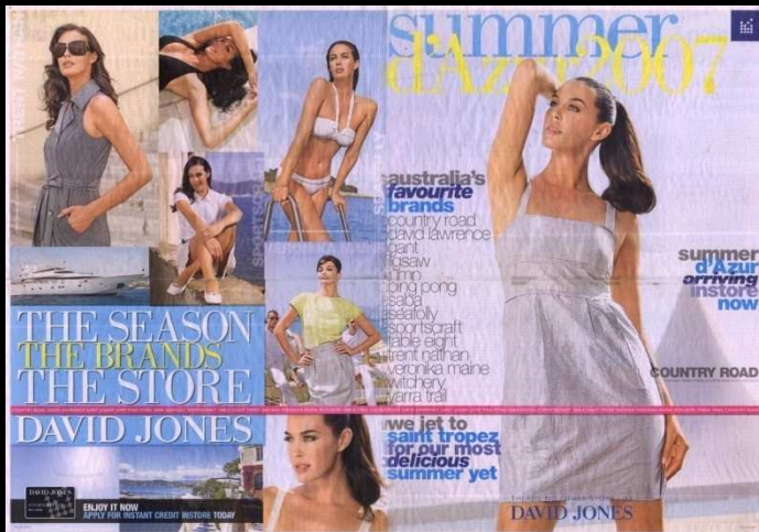
Brand ambassador, Megan Gale, introducing David Jones' summer fashion.

“It makes you replay the TV ad in your head.”