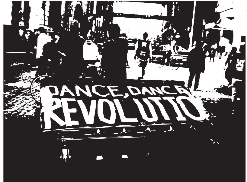
All information was found and compiled from posts to www.mke.indymedia.org and www.infoshop.org

January 20th: Many windows and ATMs smashed and vandalized at the US bank on North Avenue.