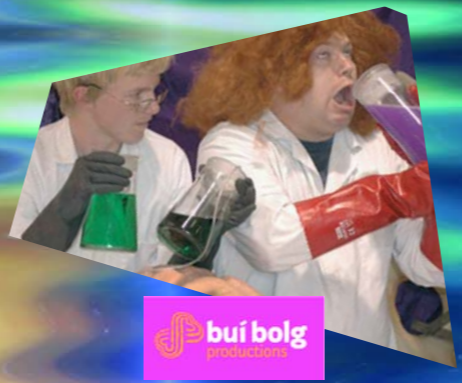
buí bolg productions