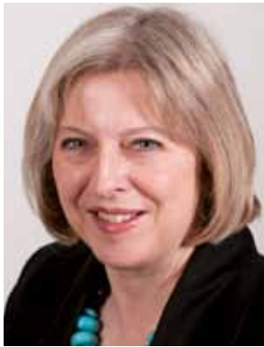
The Rt Hon Theresa May MP Minister for Women and Equalities