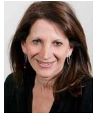
Lynne Featherstone MP Parliamentary Under Secretary of State Minister for Equalities

This Government's guiding principles are freedom, fairness and responsibility, and a shared desire to work in the national interest. We want to tear down the barriers to equal opportunities and build a fairer society. We are committed to giving people the power to improve our public services through greater transparency and democratic control. Transparency is essential to improving performance across the public sector, generating value for money from services and ensuring our public services meet the needs of our diverse communities and support greater equality: we believe that citizens should be able to hold public bodies to account for how their public services are designed and delivered, at what cost and with what effect.