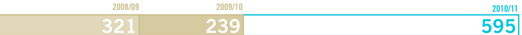
Figure 1: Number of websites closed in the last two years with projection if 75% of those remaining were to close.