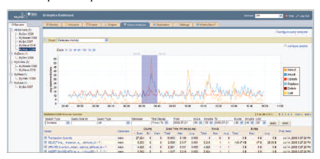
Figure 2. The MySQL Query Analyzer, with the correlation graphs, allows DBAs and developers to filter and analyze problem queries by highlighting the time frame of interest.

Queries are presented in an aggregated view across all MySQL servers so DBAs and developers can filter for specific query problems and analyze their most expensive code. With the MySQL Query Analyzer, DBAs can improve the SQL code during active development and continuously monitor and tune the queries in production.