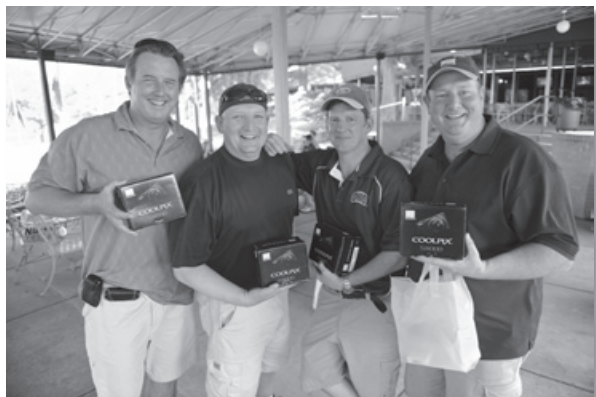
The Winning Team with their new Coolpixs.