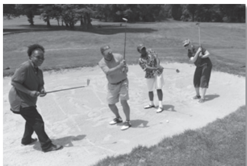
A day at the beach