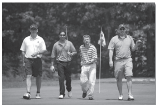
The magnificent four