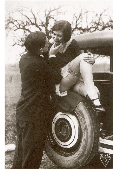
Made in Montreal, Winter 2006.