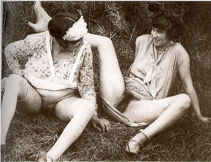
A zine for those seeking a second opinion.