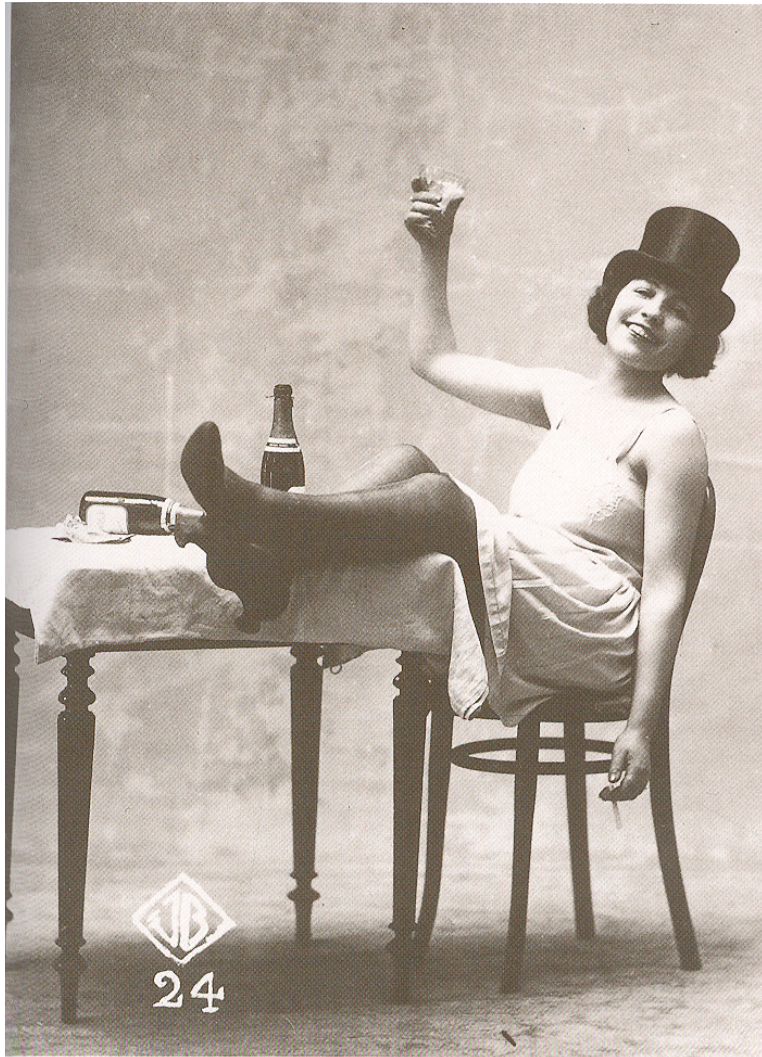
The Diet for a New Vagina!

the pill, you can also opt for the pull-out method.