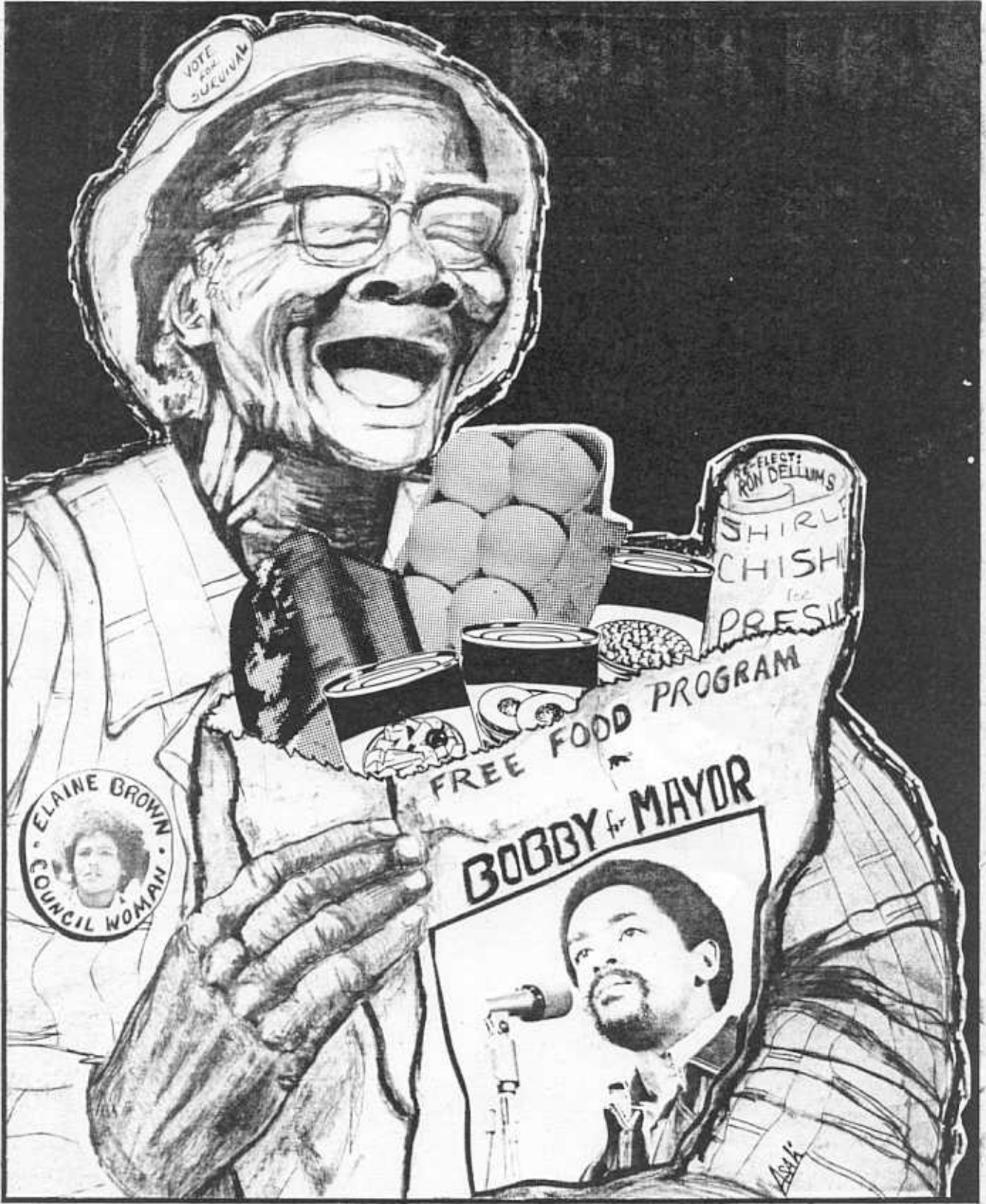
MIXED MEDIA: GRAPHITE PENCIL, GREASE PENCIL, AND PHOTO CUT-OUTS