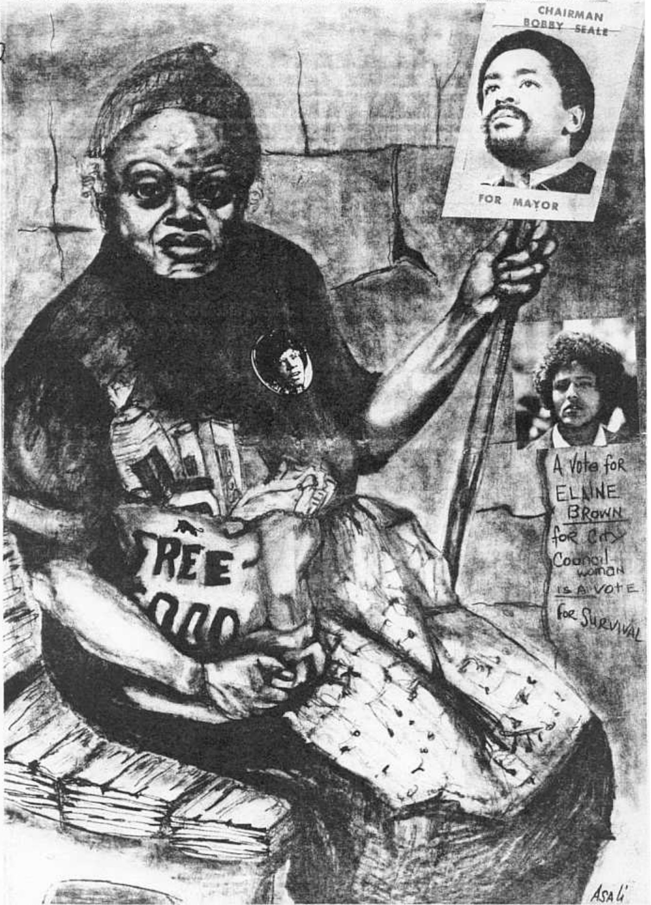
GRAPHITE PENCIL DRAWING WITH PHOTOGRAPH CUT-OUTS