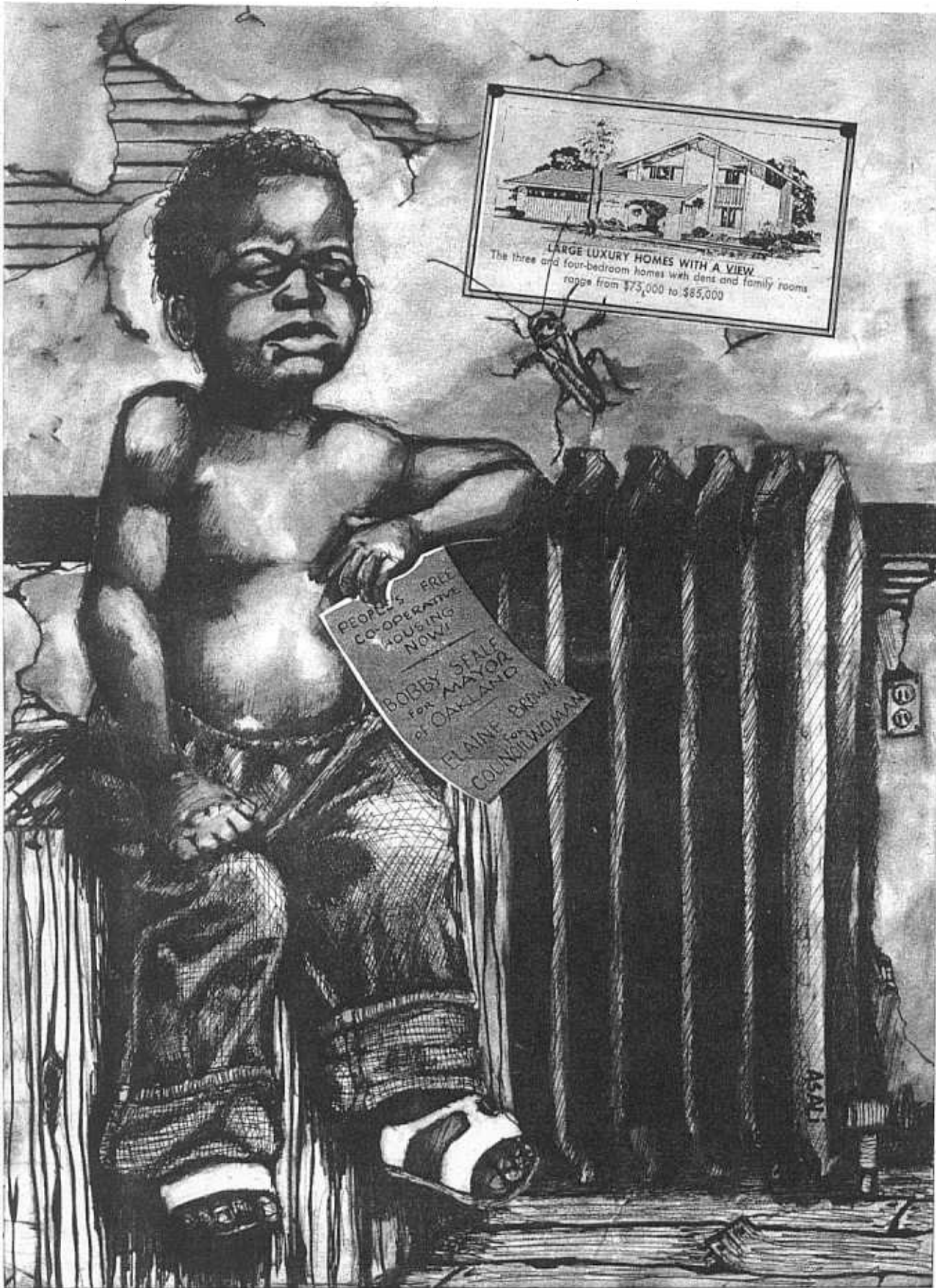
MIXED MEDIA: PENCIL, PEN, AND INK WASH