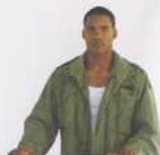
Sam Durant, Reflection , 2002, C-print.