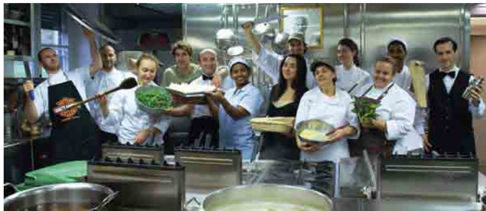
Right: The kitchen staff cuts up, fall 2008.