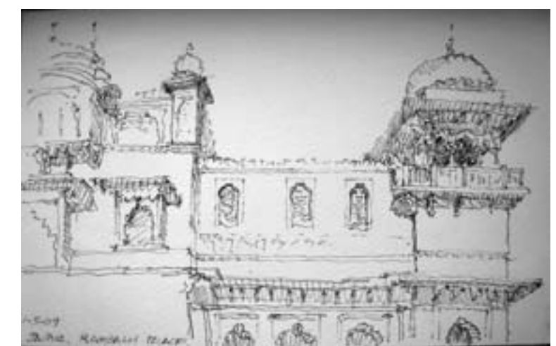
Above: Rambagh Palace, Jaipur, Rajasthan