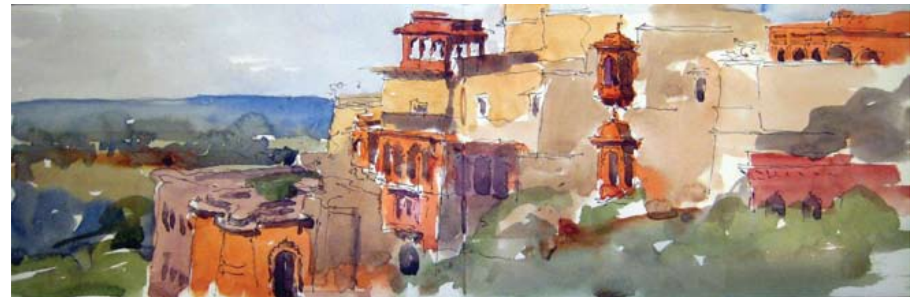
Below: Neemrana Fort Palace, Rajasthan

The current portfolio is from a journey to some of the less well known places of Rajasthan in northern India. Our group had all previously visited the more famous places (like Udaipur, Jaipur, etc.), so this trip took us to a series of princely states, each with its own distinct identity and often a spectacular palace turned into a magnificent hotel.