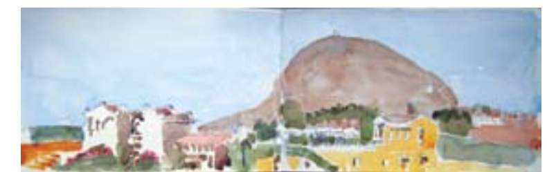
Above: Narial, Rajasthan as viewed from Rawla Hunting Lodge