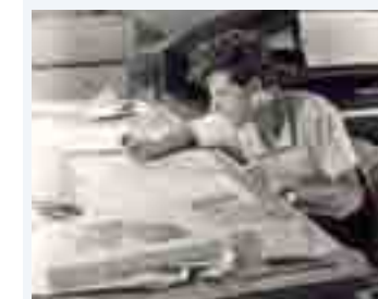
Lukas Foss in his Casa Rustica studio at the AAR, ca. 1951.

"A five-note chord dominates the composition. It is endlessly repeated, varied, permuted, transposed and inverted. It invades the entire piece via persistent, pulsating, echoing and crisscrossing quarter notes. Toward