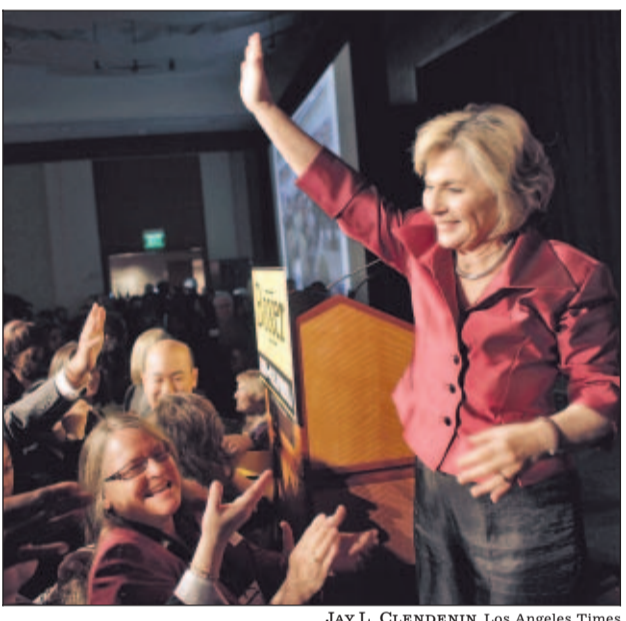
CONFIDENT: Sen. Barbara Boxer waves to supporters at a party in Hollywood. The Bay Area Democrat was leading in her race to return to the Senate.

Boxer claims victory in her reelection battle, but Fiorina refuses to concede their Senate contest.