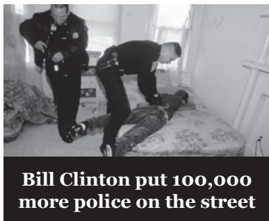
Bill Clinton put 100,000 more police on the street

Some argue that we must support Obama or else we are supporting McCain. We in the Uhuru Movement don’t believe our community should restrict its political options to a choice between one white ruling class party or another. In fact, the black community’s most recent experiences in the U.S. electoral arena have resulted not only in the Republican Party’s theft of our votes. Prior to that we suffered some of the worst attacks on our community at the hands of the Democratic Party administration of William Jefferson Clinton, who put 100,000 more police on our streets to murder our people, privatized the prisons to exploit our unpaid labor, and discontinued the public subsidies for impoverished children and families that had been won by African people as a concession to our movement of the 1960s.