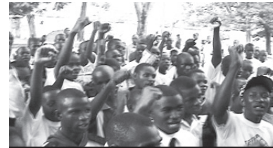
African people worldwide are struggling for self-determination

liberation of Africa and all its resources as the birthright of every African person anywhere in the world. This is only just.