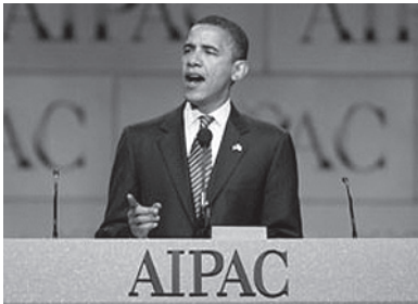
Obama addresses the 2008 American Israel Public Affairs Committee (AIPAC) Policy Conference