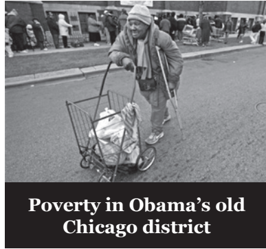
Poverty in Obama's old Chicago district