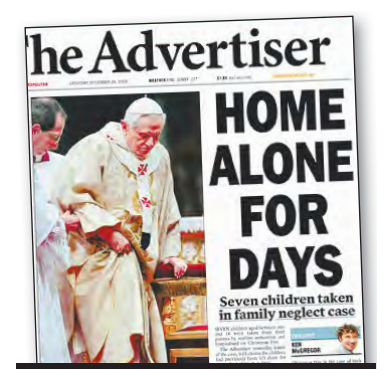
From Saturday's Advertiser

The mother said she co-operated with police after they responded to her call for assistance in a domestic dispute between her former partner and her father – also residents