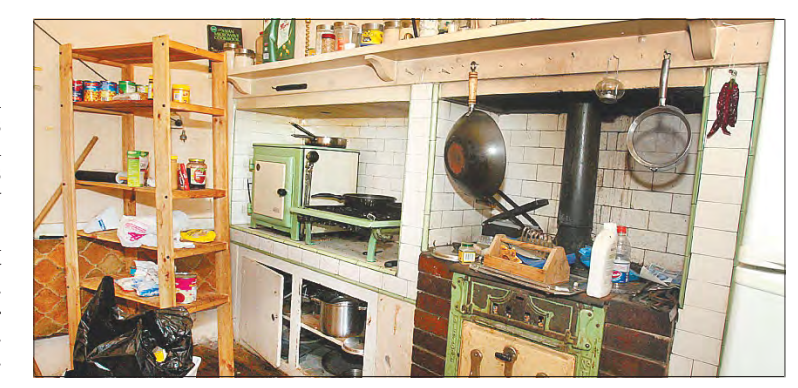
RUN-DOWN: The kitchen in the house, deemed unfit for children.

She claims she was told her situation was "not desperate enough" for her to get Housing