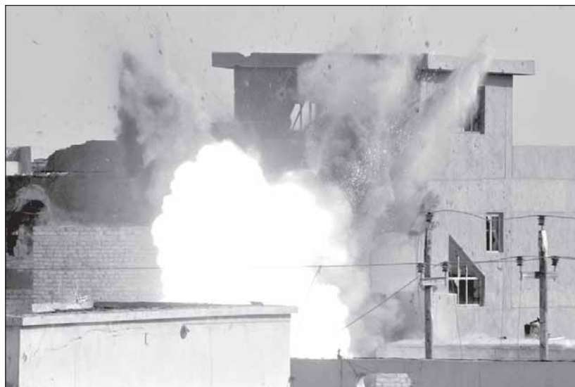
A precision air strike takes out an insurgent stronghold as Coalition Forces move forward through Fallujah during Operation Al Fajr.