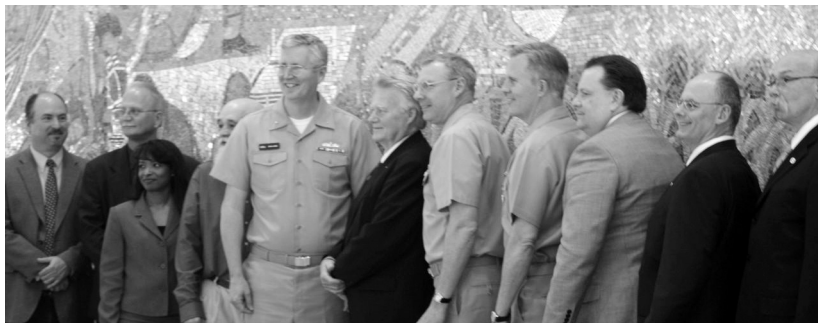
A coalition of unions, including the Metal Trades Department formally signed a groundbreaking partnership agreement with NAVSEA (Naval Sea Systems Command) at ceremonies at the AFL-CIO Headquarters Building in Washington, D.C. on April 19th.