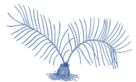
Zamia spartea , Camotillo Mexico. IUCN: Critically Endangered

Subtarget 2: 40% of the native species in Mexico categorized as “at risk” under NOM-059 are represented in Mexican botanical garden ex situ collections of plants, tissue, and seeds.