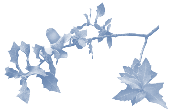
Quercus hinckleyi , Hinckley Oak Mexico. IUCN: Critically Endangered U.S. ESA: Threatened