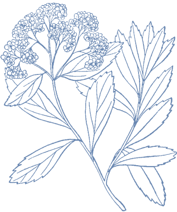
Spiraea virginiana , Virginia Meadowsweet U.S. ESA: Threatened

The Applied Plant Conservation Program, a joint partnership for education by the Center for Plant Conservation, Denver Botanic Gardens, and the United States Botanic Garden, is a notable example of professional training and institutional capacity building. More information on the program is available on the institutions' websites.