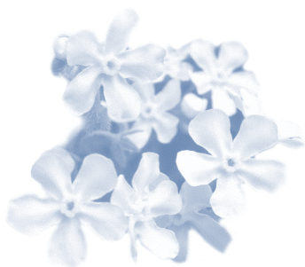
Hackelia venusta , Showy Stickseed U.S. ESA: Endangered

Information on the genetics and population biology of rare plants and their relation to conservation is available on the Center for Plant Conservation website, www.centerforplantconservation.org