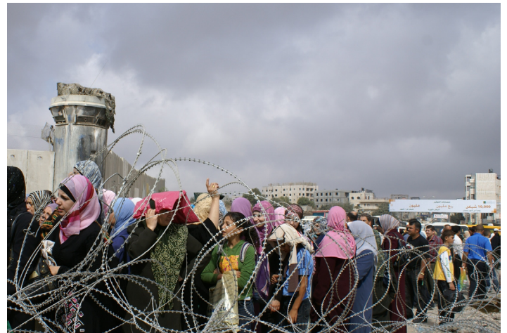
Palestinian worshippers attempting to access Jerusalem for Friday prayers during Ramadan.

A recently issued OCHA report notes that despite some positive steps taken by the Government of Israel that aimed at easing internal movement for Palestinians in the West Bank, their impact remains limited geographically. Of the 100 unstaffed obstacles that the Israeli authorities announced that they had removed during the period covered by the report (30 April to 11 September 2008), only 25 were significant