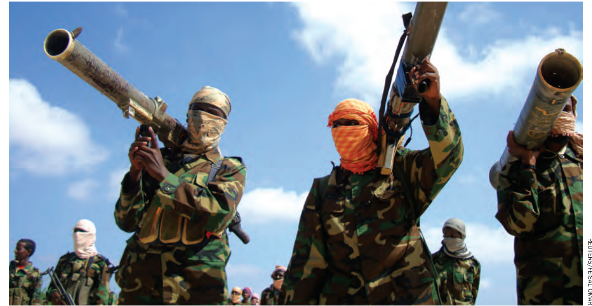
The Islamist insurgent group Al-Shabaab has consolidated control over much of the country, imposing censorship through violence and intimidation.

CPJ has been a leading voice in the global press freedom movement for nearly 30 years. Our knowledge and credibility enable us to directly engage world leaders and policymakers on press freedom issues.