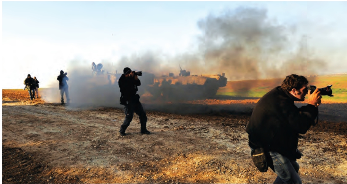
Journalists photograph Israeli troops near the northern Gaza Strip on January 7, 2009, amid a three-week military offensive.