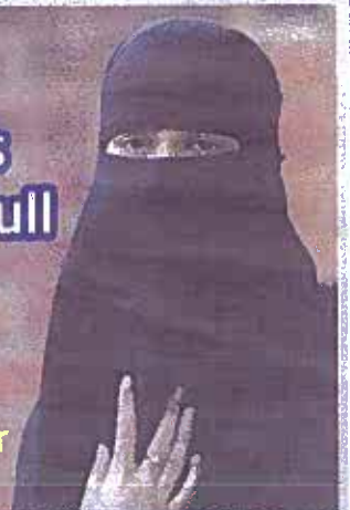
Woolas is targeted for saying teachers should not wear the full veil