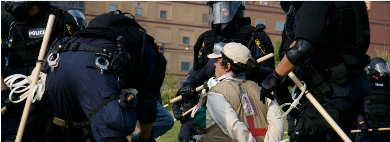
Medic arrested at RNC.

The CRASS Courtwatch Working Group has been hard at work attending court appearances and keeping track of everything happening to our comrades within the various courthouses.