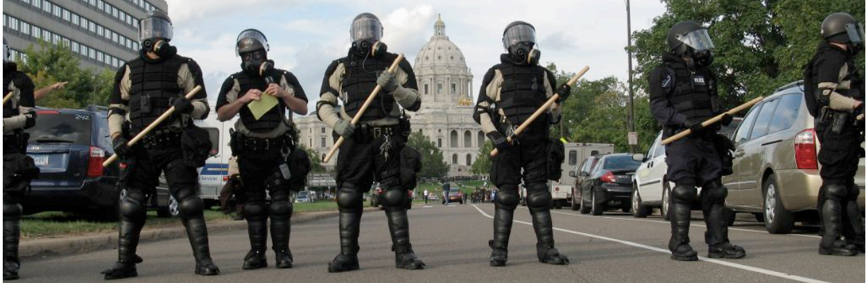
RNC Day 4.

Information and resources for the media from the Community RNC Arrestee Support Structure ( www.RNCaftermath.org )