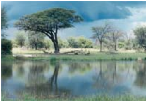
Hwange Estate in 2001, Kanondo pan