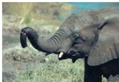
Bubble's trunk injury from a snare