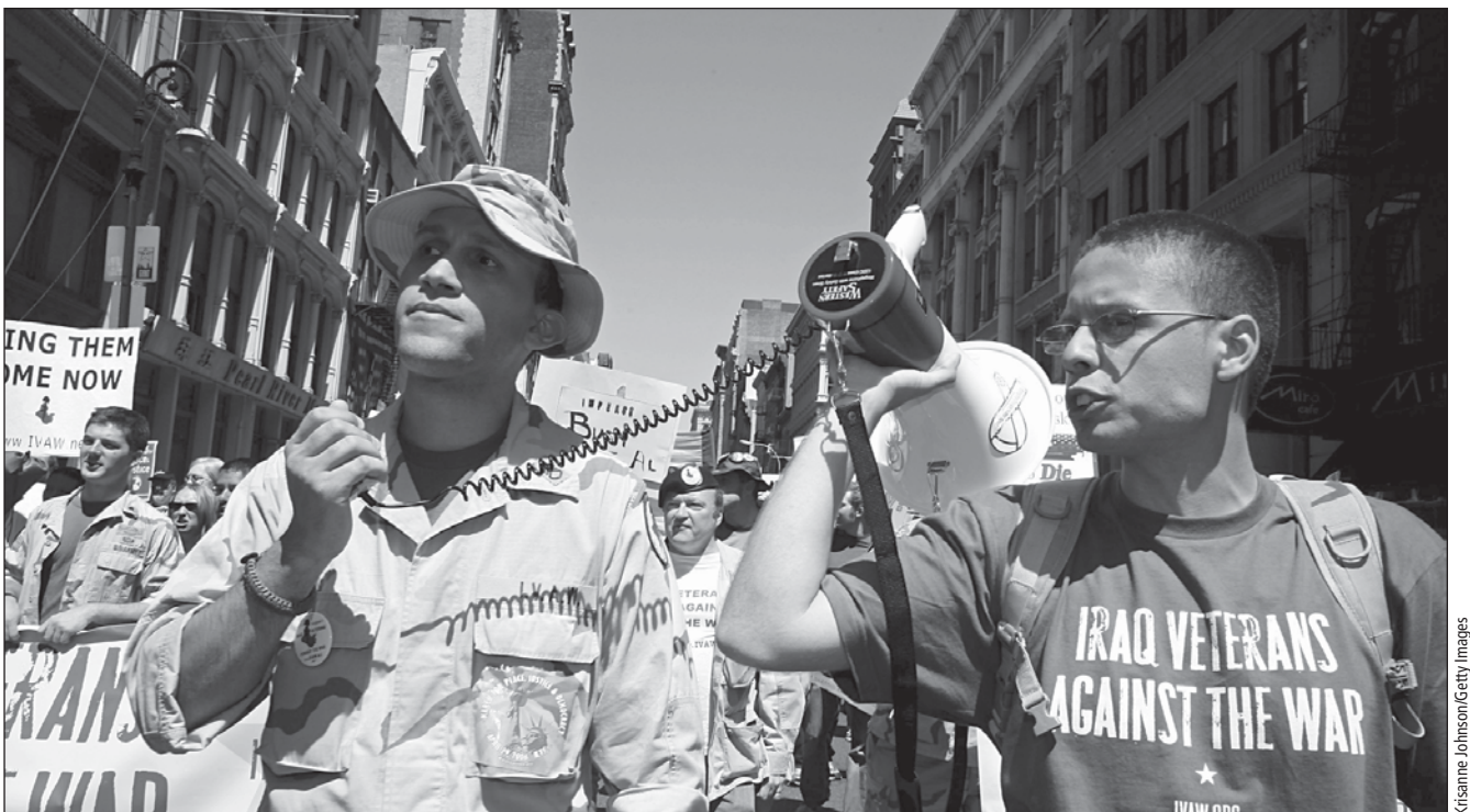
Iraq Veterans Against the War is growing rapidly, especially since the recent involuntary recall of Marine reservists. The most recent poll found that 72 percent of U.S. soldiers in Iraq believe the U.S. should withdraw.

'Every Iraqi party and tribe told us, "We want the Americans out of our country."'