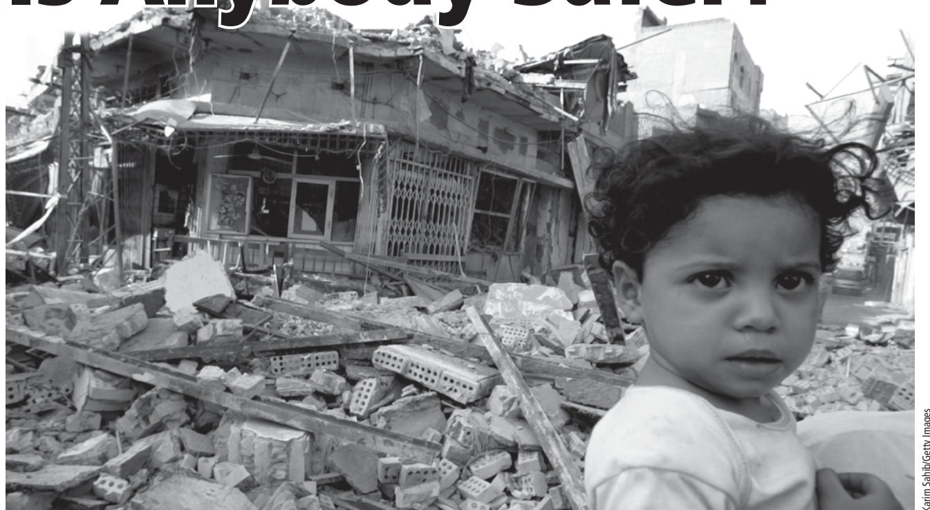
A bomb blast in the heart of Baghdad destroyed this young boy's home. The Pentagon reports that Iraqi deaths are at an all-time high, nearly 120 per month. The most recent poll found that 92 percent of Iraqis favor U.S. withdrawal.