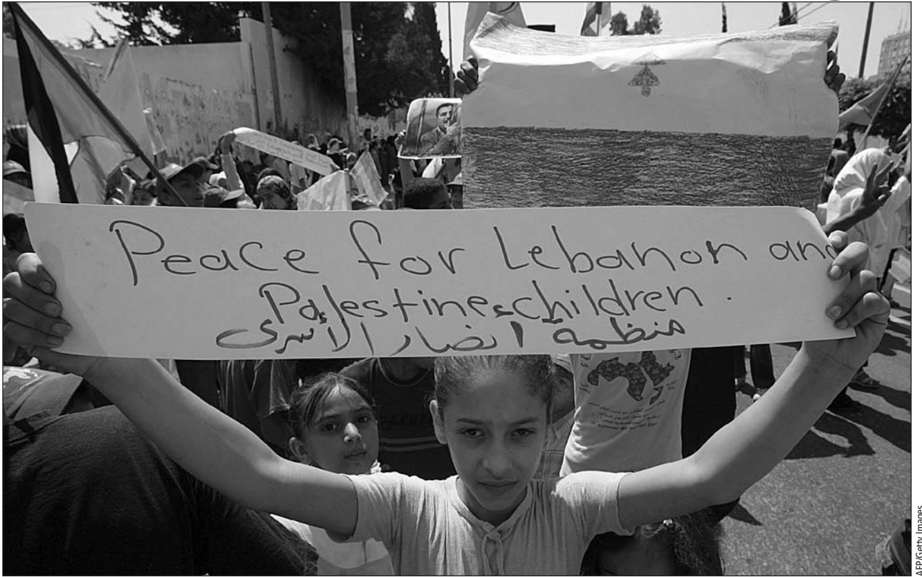
A Palestinian child displays a placard as another holds up a drawing of the Lebanese flag to protest the Israeli blitzing of Lebanon and the Gaza Strip in front of the offices of the United Nations in Gaza City on July 31.

The famed first prime minister of Israel, David Ben-Gurion, privately admitted: "If I were an Arab leader I would never make terms with Israel. We have taken their country. Sure, God promised it to us, but what does that matter to them? Our God is not theirs. We came from Israel, it's true, but two