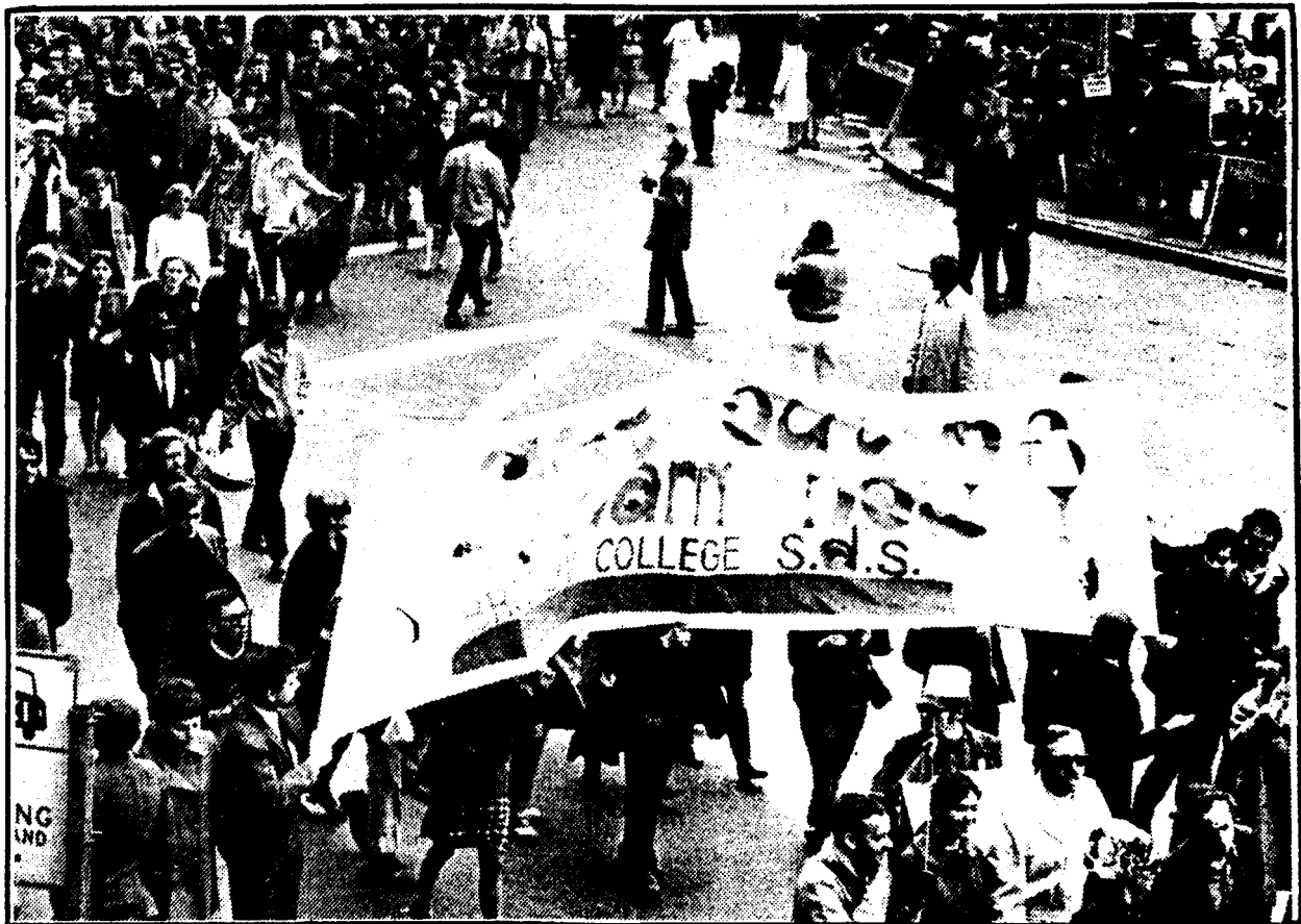
PLP'ers in SDS were the first to raise the slogan 'Out of VietNam Now' pointing out that the war was no 'mistake.'

Part two of the History of the Progressive Labor Party will appear in a future issue of PL Magazine