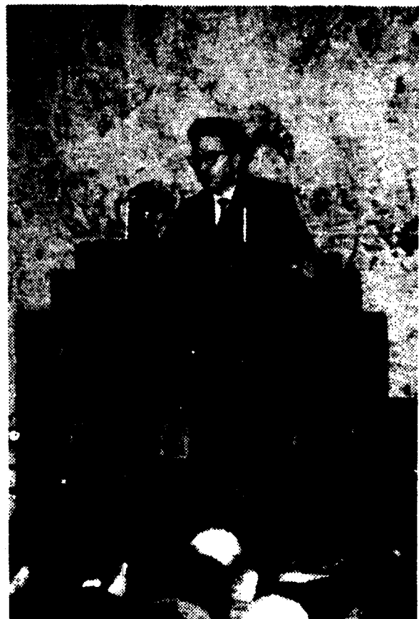
PLM Trade Union Organizer speaking at same rally.