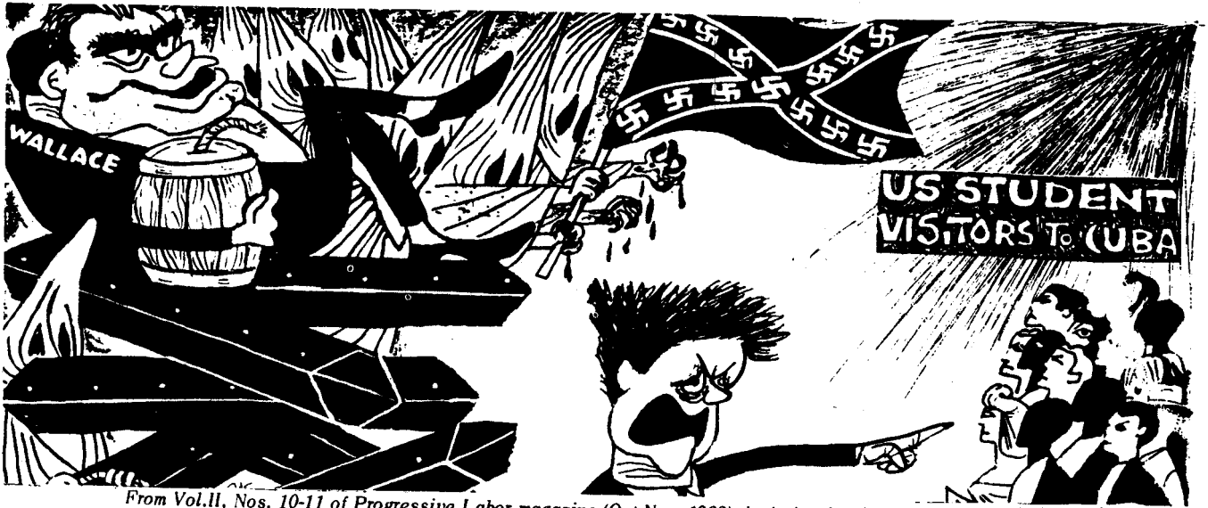
From Vol. II, Nos. 10-11 of Progressive Labor magazine (Oct-Nov., 1963) depicting fascist U.S. bosses pointing at students who had broken the travel ban to Cuba.