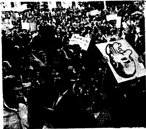
The May 2nd Movement demonstration (pictured above) led to the massive marches (left insert) that took place in Washington D.C., NYC and San Francisco, demanding U.S. Out of Vietnam Now-

class collaboration with such slogans as "Ban the Bomb" "Summit Negotiations to Ease International Tensions" "Peaceful Co-existence" "For a Sane Nuclear Policy" etc.