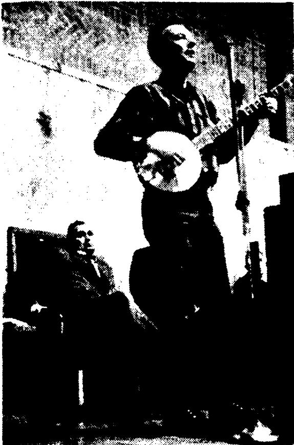
Pete Seeger at PLM support rally. Gibson in background.