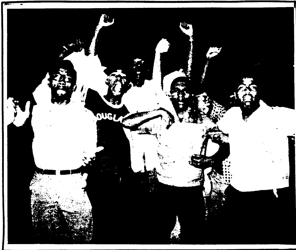
Summer of '64, N.Y.C. Workers demonstrate their anger at racist cop brutality which was on the rise as lip-servi- ce to their needs was voted in as civil rights amendments.

rests. (They didn't give figures on the killings, the beatings, the bombings, the police dog bites, the fire hoses and other brutalities against the people.)