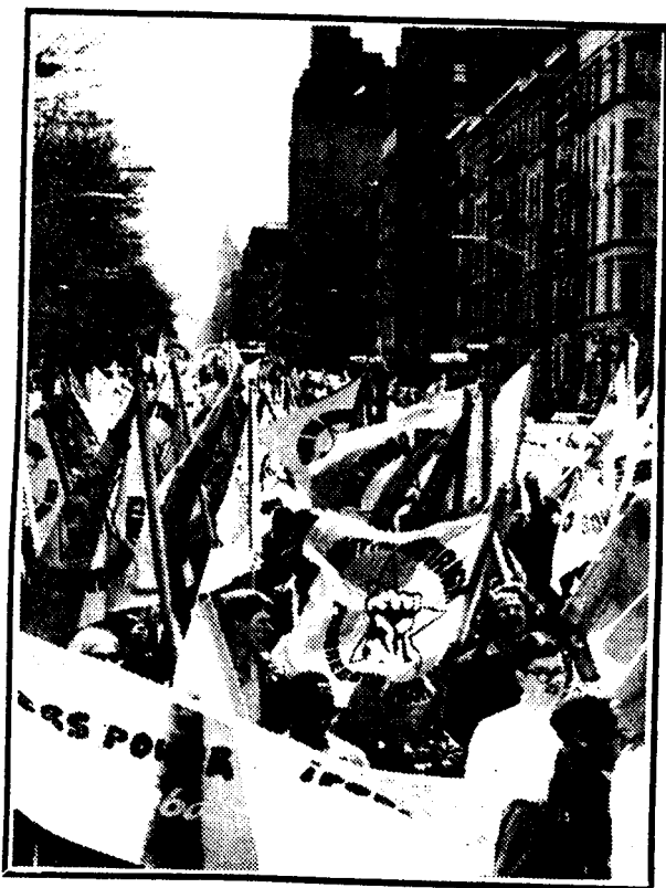
The Progressive Labor Party was formed to take up the red flag of revolution from the corrupt 'C'P USA.

dustrial sections of the party. While the Left vigorously fought the Gates right-wingers and were critical of the Foster-Dennis center group, they, too, were divided and confused about the correct course. One group, about 500 strong, broke from the old CP and immediately set out to build a new communist party. Known as the Provisional Organizing Committee for a new communist party (POC), they rapidly disintegrated because: 1) They had no program other than that the old communist party was no good; 2) They continuously split over different personality clashes in their leadership; 3) They mistakenly elevated secondary differences about practical activities to matters of principle and stewed in their own juice.