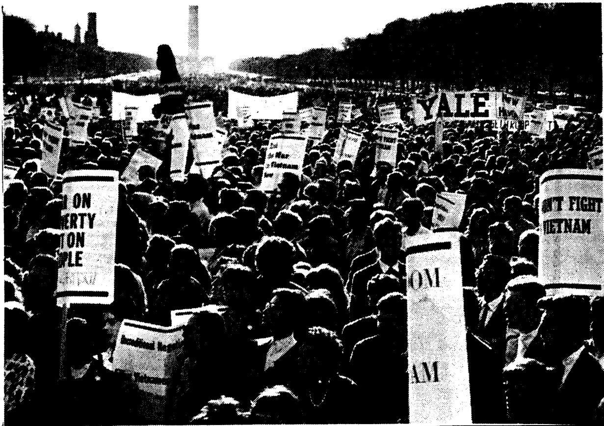
From its base on hundreds of college campuses, SDS brought tens of thousands to demonstrate against the war.

never split for petty reasons. We split away from enemies and will struggle to destroy them, but with friends and comrades we always strive for unity no matter how sharp our differences. While on the surface it appeared that Road to Revolution led to a minor split in PLM the reality is that it led to a much greater unity.