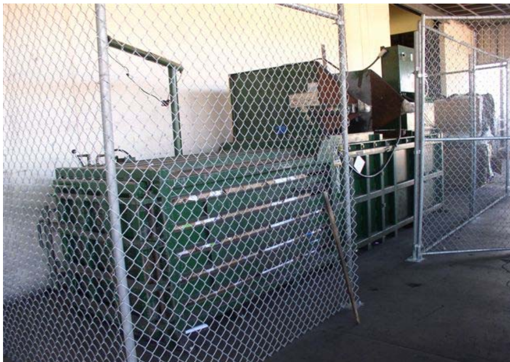
Exhibit 3. Alternate side view showing the baling chamber.