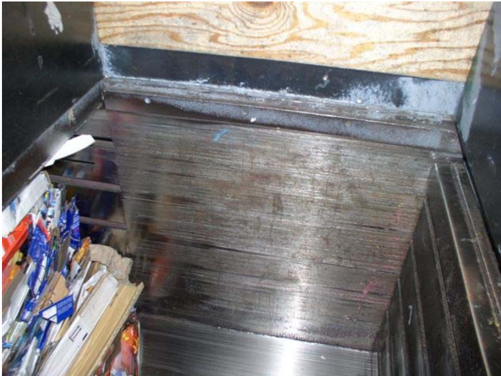
Exhibit 6. Inside view of the compaction chamber.