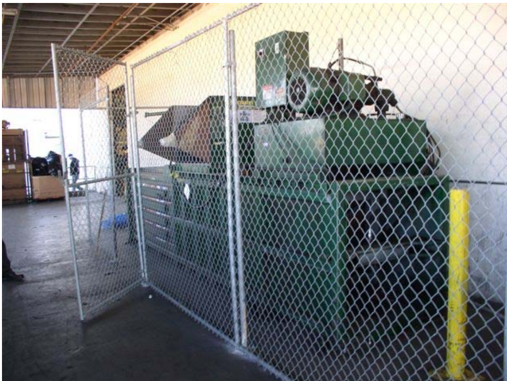
Exhibit 2. Side view of the cardboard baling machine.