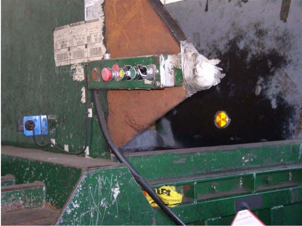
Exhibit 7. The controls and electronic sensor.