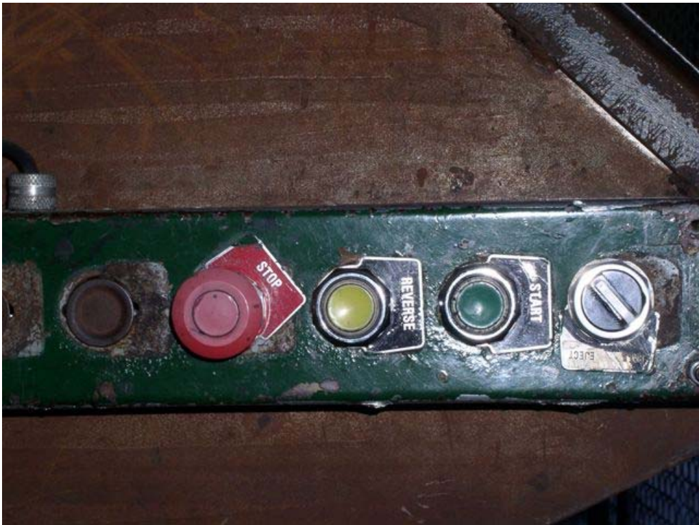
Exhibit 8. Close-up of the controls.