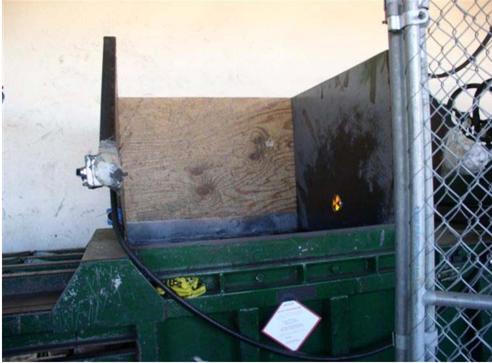
Exhibit 5. Closer view of the feed hopper.