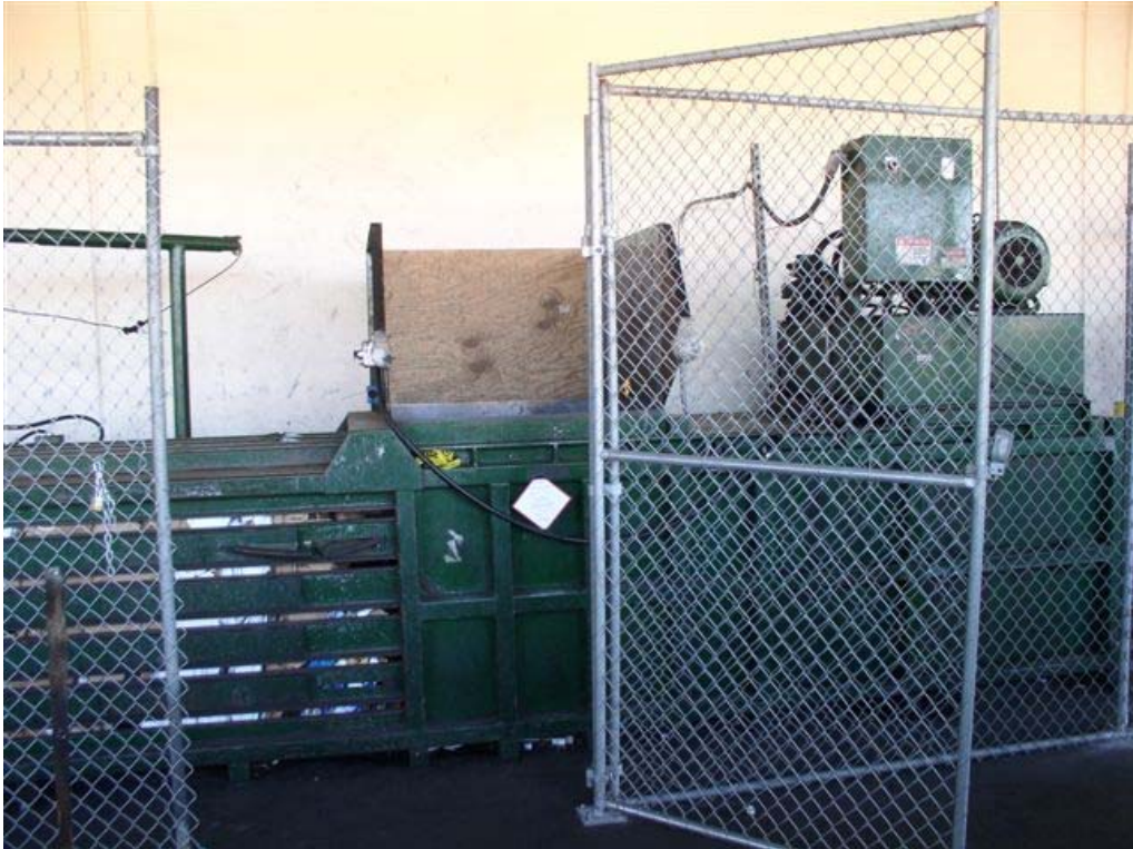
Exhibit 1. The front view of the cardboard baling machine involved in the incident.