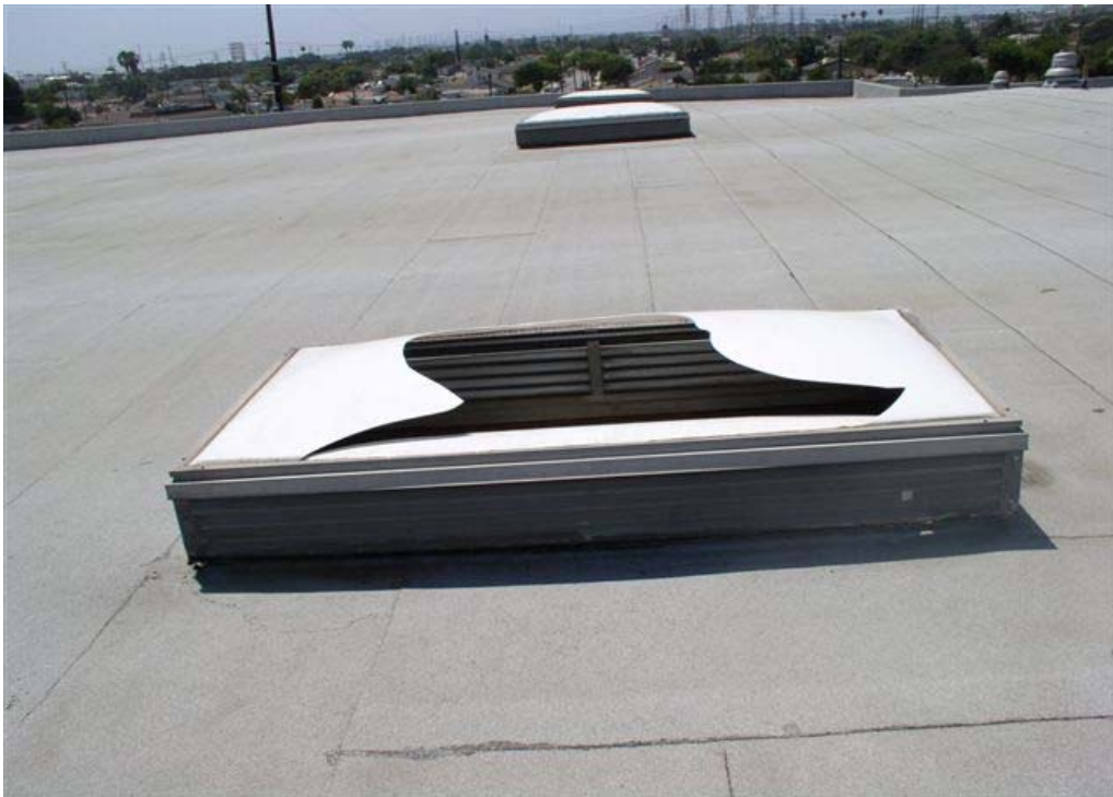
Exhibit 2. The skylight the victim fell through.