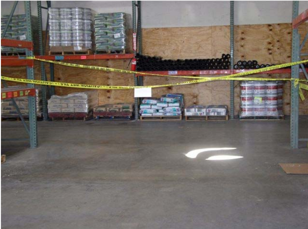
Exhibit 4. The warehouse floor where the victim landed.