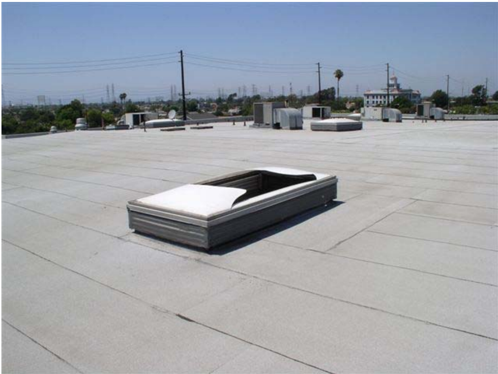
Exhibit 8. The area around the base of the skylight.