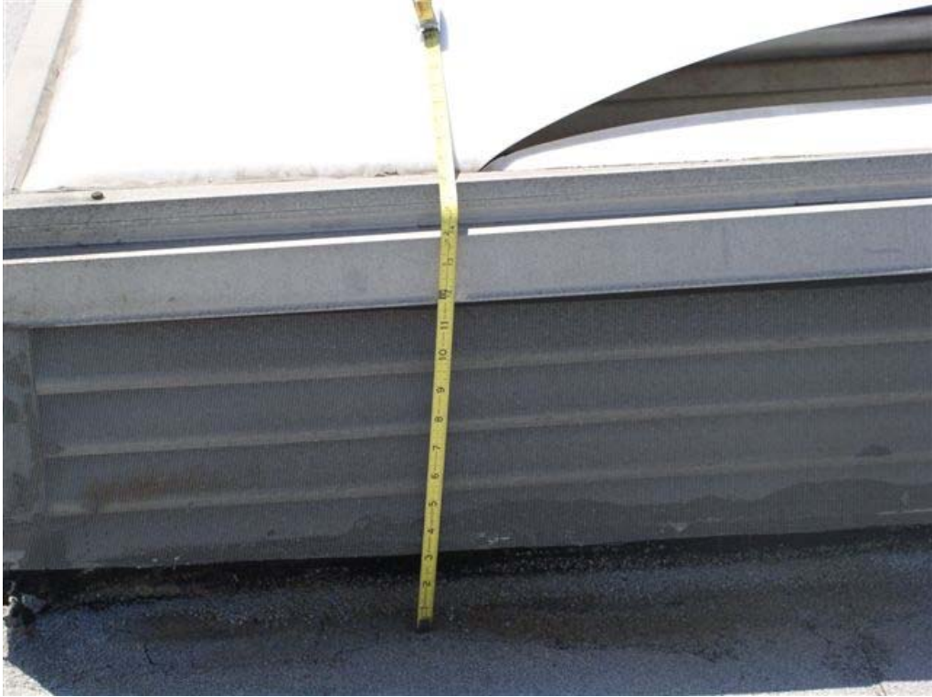
Exhibit 7. The skylight base was approximately 15 inches tall.