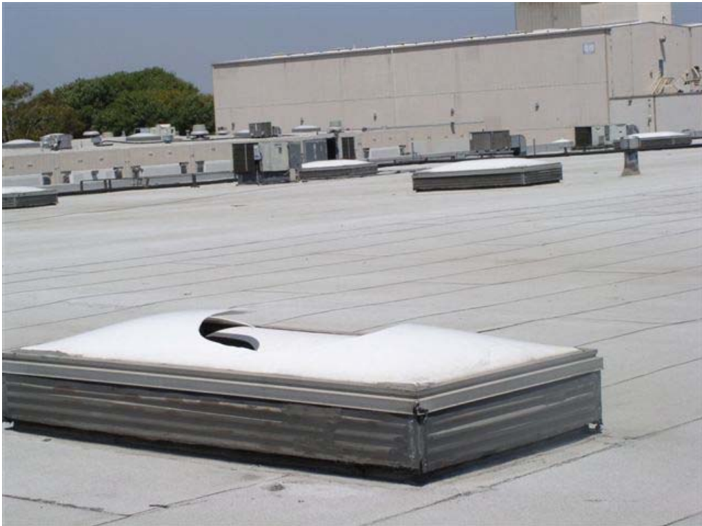
Exhibit 6. The distance between the air condition unit and the skylight.