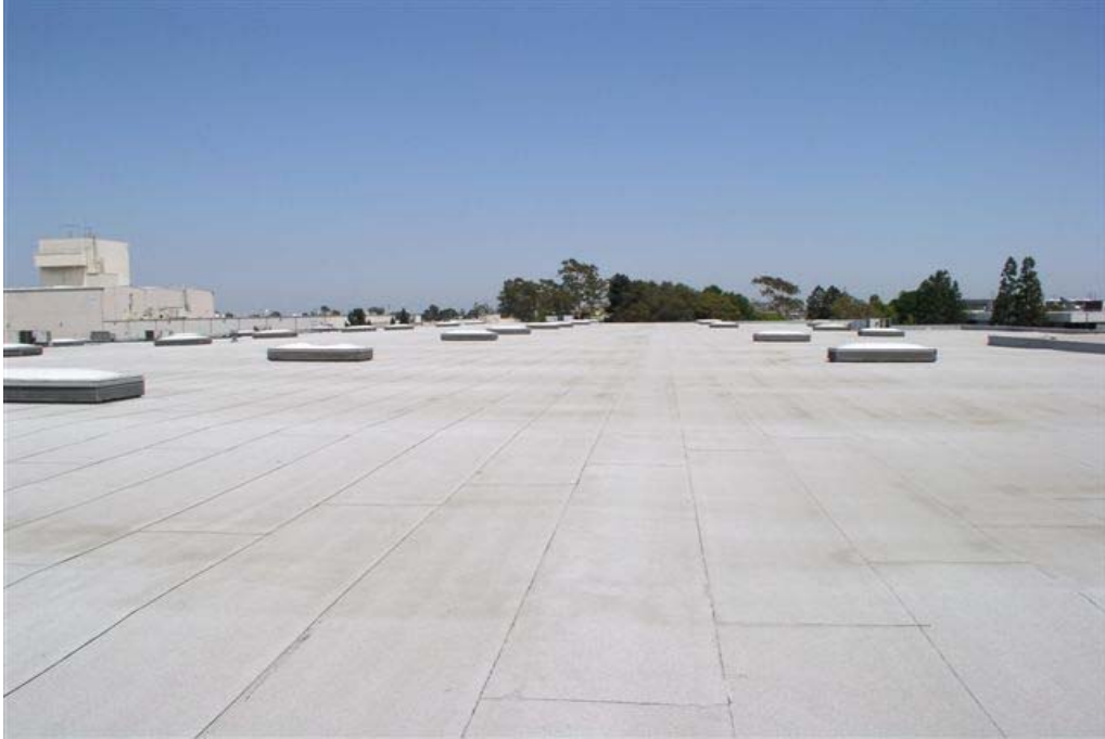
Exhibit 1. The roof of the warehouse.