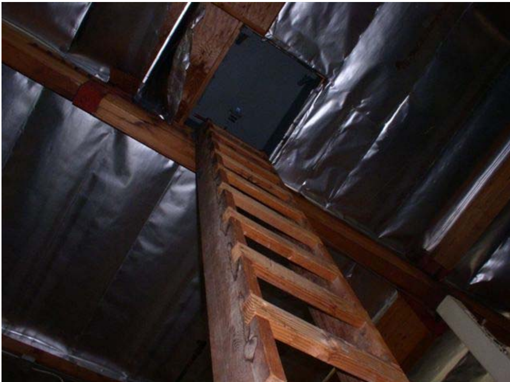
Exhibit 10. A picture looking up at the second ladder used to gain access to the roof.