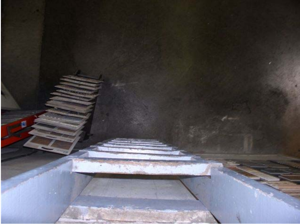
Exhibit 9. A picture from the top of the first ladder used to gain access to the roof.