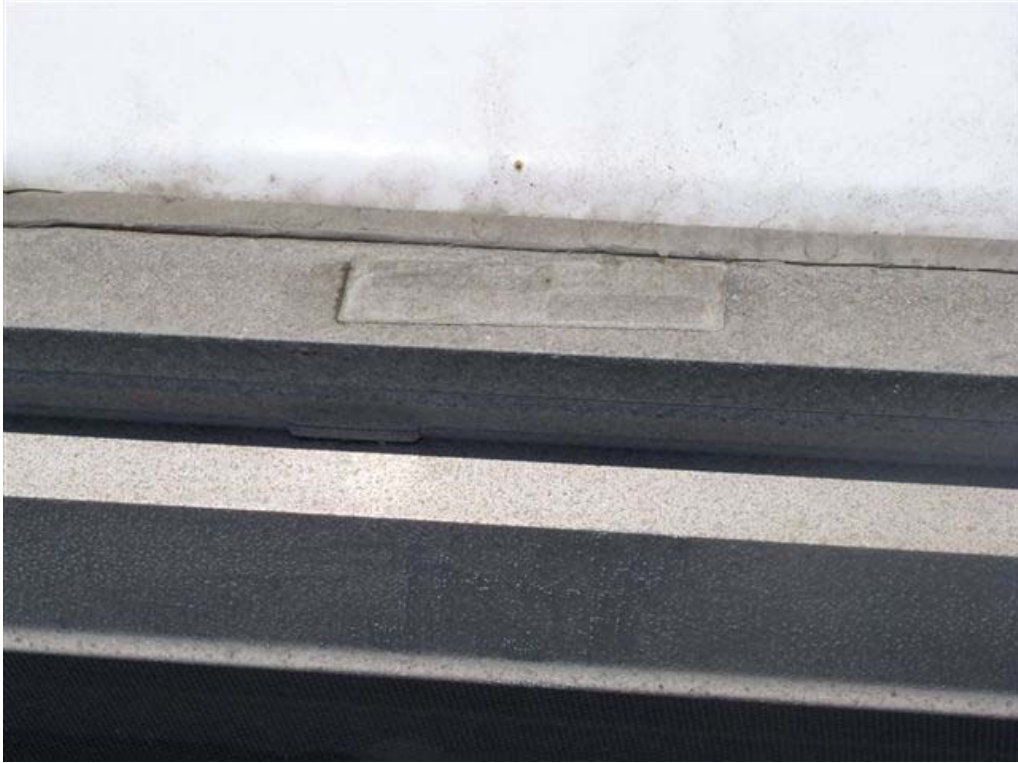
Exhibit 5. The identification label on the skylight. Exposure to the environmental elements over time has made the label unreadable.