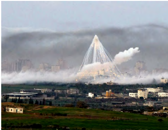
White phosphorous shell exploding over Gaza City.

Phosphorus burns carry a greater risk of mortality than other forms of burns because phosphorus is absorbed into the body through the burned area, producing liver, heart and kidney damage, and in some cases multiple organ failure. 57 In addition, white phosphorus continues to burn and eat away at the tissue for as long as it is exposed to oxygen. Consequently, the affected area continues to expand so long as the white phosphorus remains on or in the tissue.