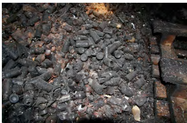
Destroyed Medicines at UN Warehouse February 2, 2009 – Gaza City