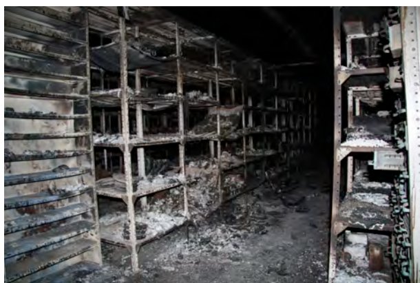
Burned-out UN Warehouse February 2, 2009 – Gaza City