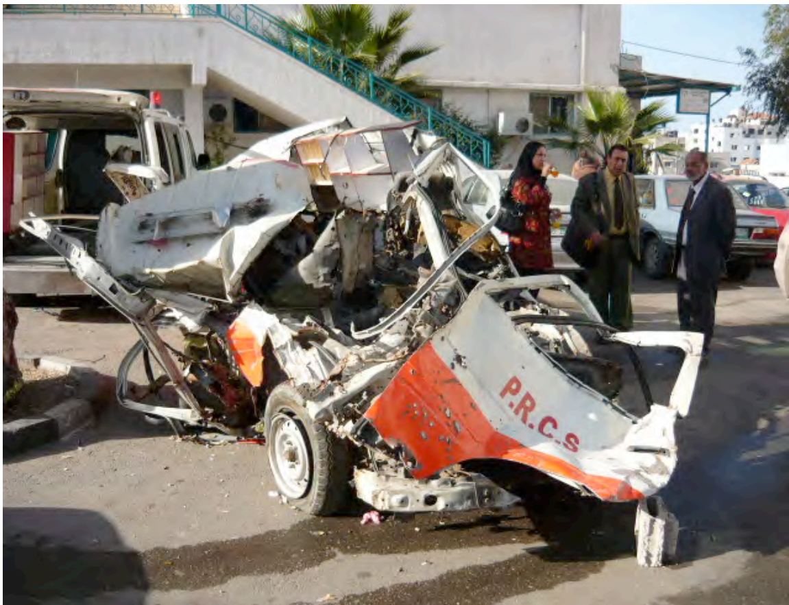
Palestinian Red Crescent Society Ambulance Destroyed by Israeli Military – February 3, 2009, Shifa Hospital

In addition to denying access to the wounded, Israeli forces often fired on emergency medical teams attempting to reach those in need of help. As stated above, attacks on medical personnel, medical units, and medical transports exclusively assigned to carry out medical functions are prohibited under international humanitarian law. However, the Palestinian Red Crescent Society and the Palestinian Ministry of Health informed delegates that Israeli forces killed 15 Palestinian medics and injured 21 in the course of the December 27 – January 18 assault. In addition, Delegation members saw ambulances seriously damaged and destroyed; according to the Palestinian Red Crescent Society, 16 of their ambulances were damaged and three were completely destroyed.