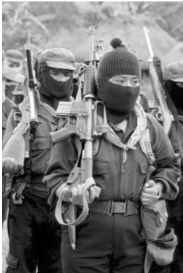
Women of the EZLN.

from Free Tibet Syndrome is simple and predictable: not in my backyard.