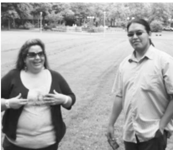
Participants in Indigenous Leadership Forum