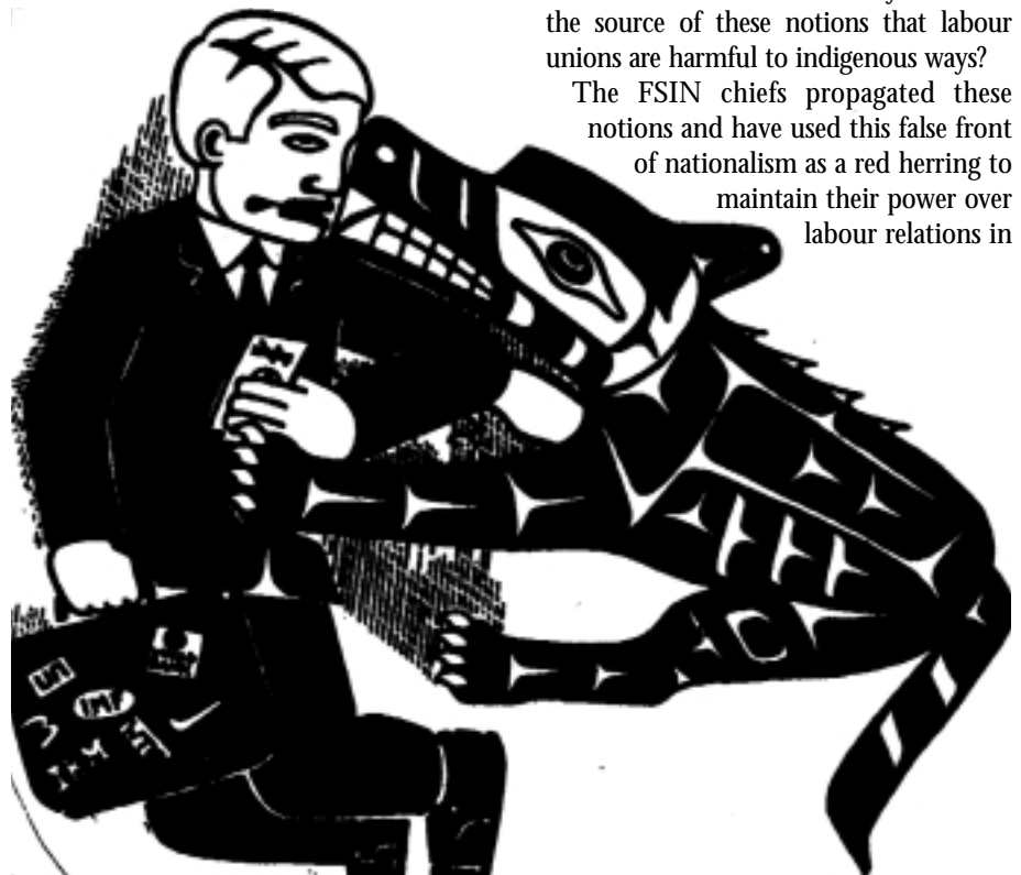
DRAWING BY GORD HILL, KWA KWAKA WAKW.

The FSIN chiefs propagated these notions and have used this false front of nationalism as a red herring to maintain their power over labour relations in