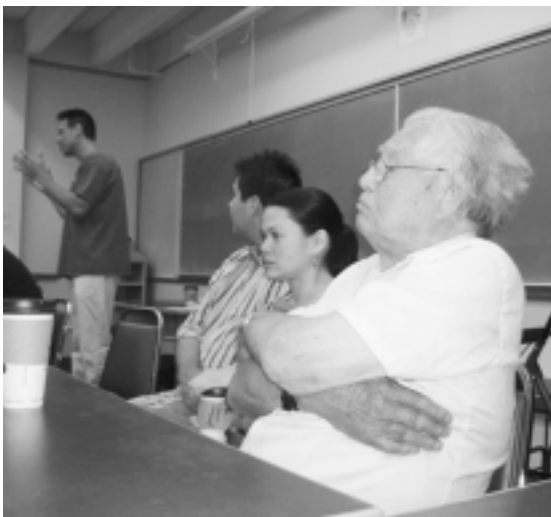
Participants at Indigenous Leadership Forum

There's been a lot of machismo and drinking in the warrior movement. We need to confront and deal with these kinds of issues in order to be able to work together.★