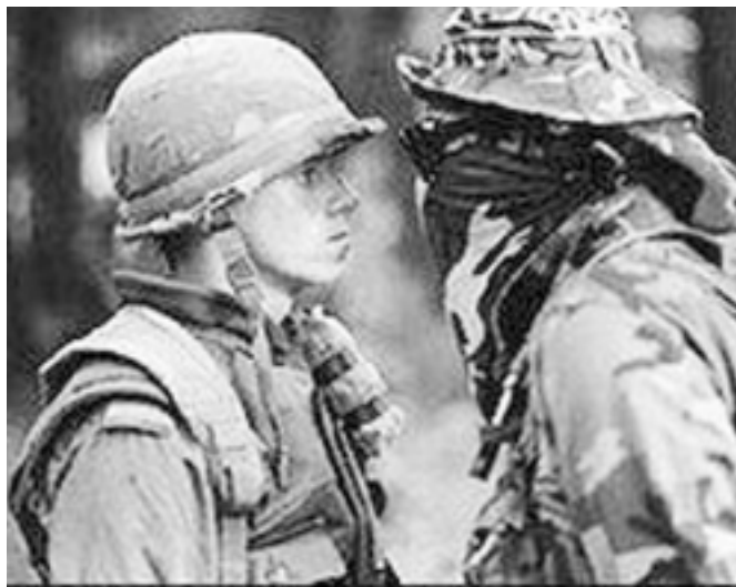
A warrior stares down a soldier at Oka.