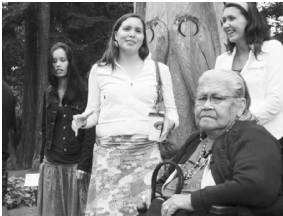
Participants at the Indigenous Leadership Forum.

THE 2006 INDIGENOUS leadership forum brought together young indigenous and settler community leaders and activists from across occupied Canada and beyond at the University of Victoria from June 5 to 16. The aim was to begin developing an authentic vision and workable alternatives for political organizing. Current state-sponsored institutions and approaches were rejected in favour of embracing true indigenous principles. The ILF is a small group of people who are committed to their homelands and local struggles, while at the same time working regionally and nationally in a coordinated effort to end colonialism in all its forms. On these pages, we include images from the 2006 event, and highlights from the discussions that took place.