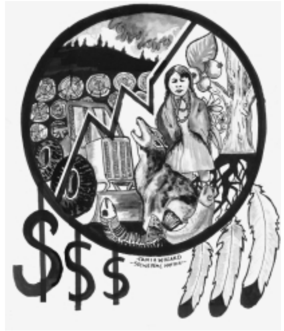
DRAWING BY TANIA WILLARD, SEWPEMIC NATION

These are but three of the countless examples of state-sanctioned theft of treaty lands that have gained national attention because of indigenous resistance in the face of serious political and military pressure. In fact, in the Delgamuukw decision (derided by the Right and the business community as unambiguously pro-Indigenous) the Supreme Court actu-