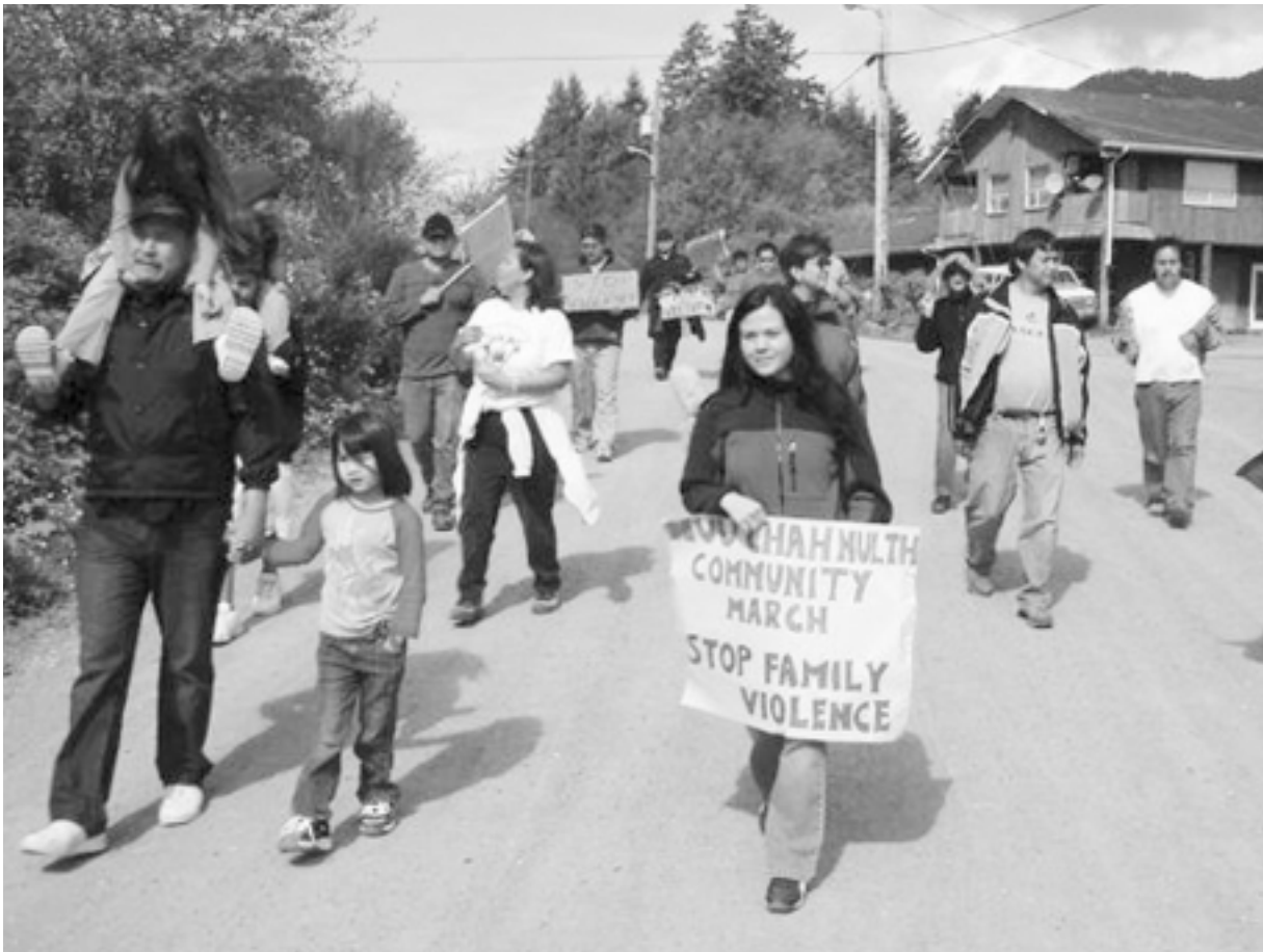
Nuu-chah-nulth march against violence.

“issue” or community. Our intent was to both politicize and provide support in terms of broadening, and in some cases building from scratch, the ability for communities to defend themselves against all forms of violence and oppression.