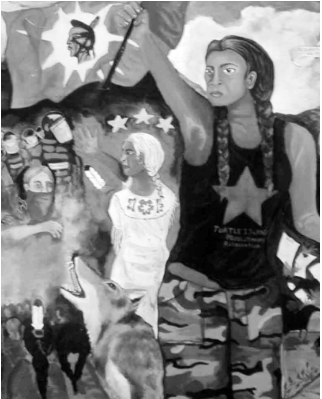
Indigenous women leading the struggle. Art by Tania Willard, Secwepemc Nation