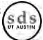
UT Austin SDS

“Curb Corn Dog Cornyn” is a part of Iraq Moratorium’s monthly nationwide “third Friday” protests against the Iraq war.