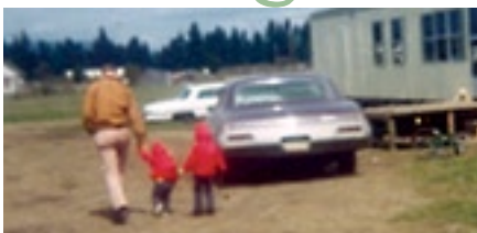
Visiting family in Rochester, WA, 1978