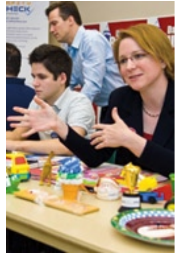
Toxic toys should not be sold.