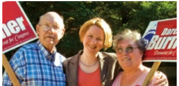
My dad and mom with me on the campaign trail