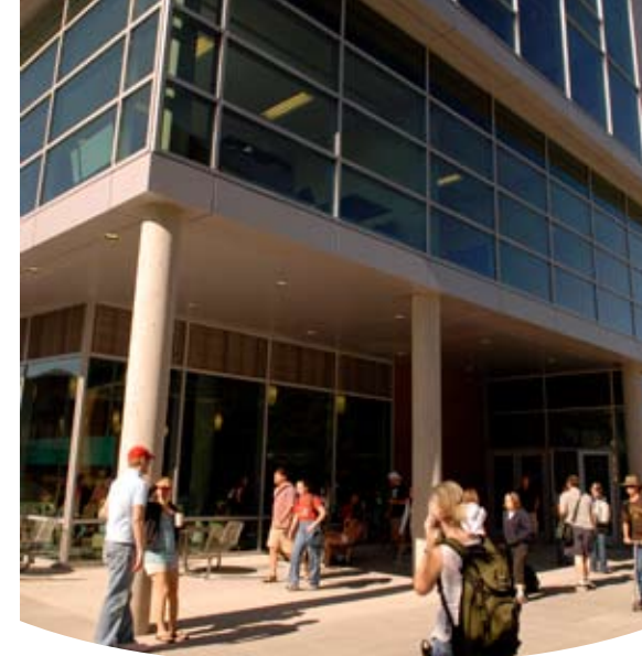
▲ The Interactive Learning Center opened in August 2007.

Major construction on two of Boise State's landmark buildings – the Student Union and Bronco Stadium – is in full swing. The expansion and renovation of the Student Union is scheduled for