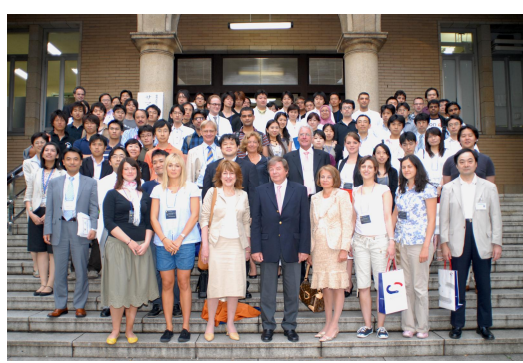
Group photo in front of Kitasato Hall