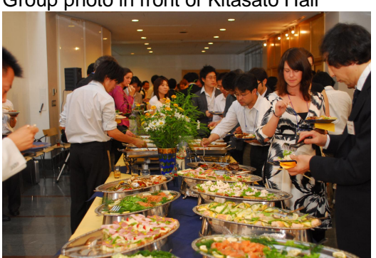
Reception at Embassy of Sweden