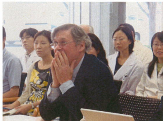
Sir Tim Hunt is listening to a lecture by a researcher of Keio Univ.