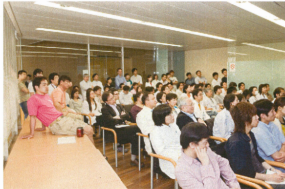
A lot of audience