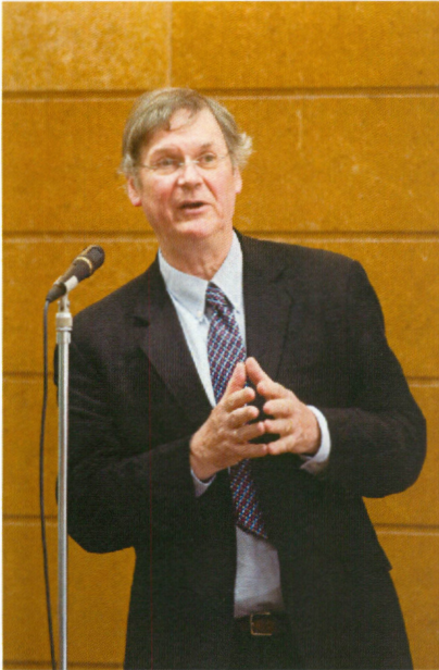
Sir Tim Hunt delivering a lecture

On June 11th, 2008, Nobel Prize scientist Sir Tim Hunt delivered a lecture entitled "Getting in and out of Mitosis" at Shinanomachi Campus. Sir Tim visited the campus before the conferral of the degree of Doctor of Medicine which was held at Mita Campus. He gave a professional lecture to about 100 people of audience of School of Medicine. Furthermore, 2 other lectures were given by 2 young promising researchers of Keio University followed by lively question-and-answer sessions. We at School of Medicine hope that academic exchange between the two will be promoted in the future.