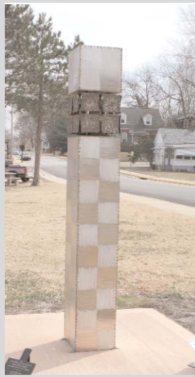
"United WE Stand" Fire House #1 Kingshighway & Morgan

Installation sites for the art were selected by Foundry and City officials,