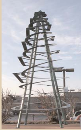
"Blue Spruce" at City Hall

A "blue spruce" sculpture outside City Hall is just one of several new surprises that have popped up around the City.