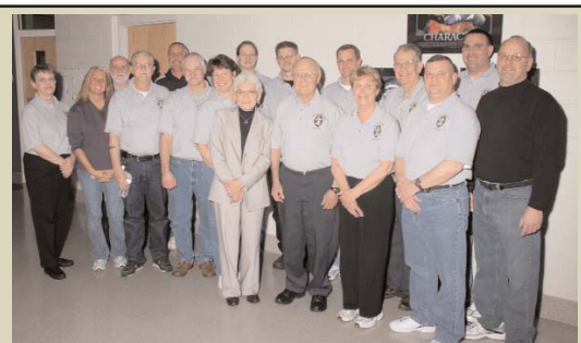
The first graduating class of St. Charles Citizens Police Academy