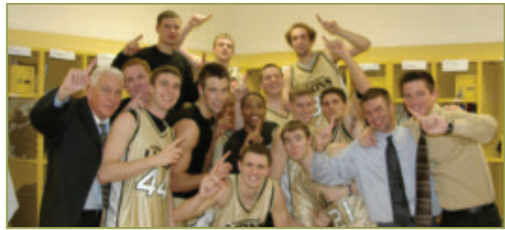
The LU men's basketball team celebrates its conference championship.