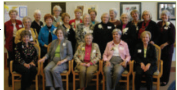
The Class of '55 gathers for a group picture at Reunion 2005