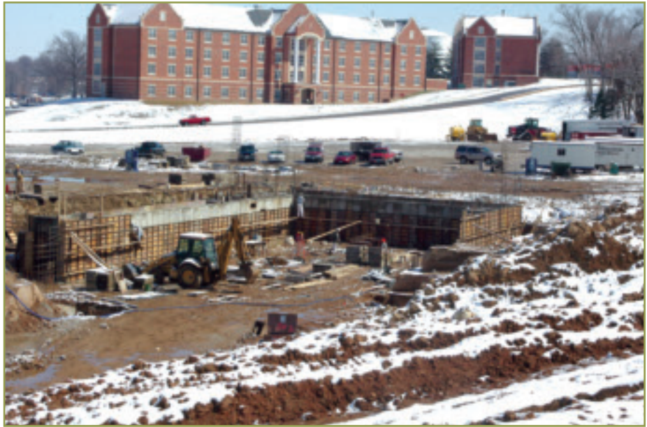
Workmen are busy with foundations and footings at the site of Lindenwood University's $32 million Fine and Performing Arts Center.

A 1,200-seat main auditorium will be the signature element of the new center, and it will be host to theater, music, dance and other productions. The structure will boast a main gallery to showcase student art and professional exhibits, and double as a reception area for events scheduled in the main auditorium.