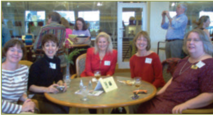
Class of 1975 members enjoy the reception sponsored by the St. Charles Alumni Club on the first night of reunion 2005.